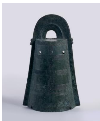
1-1 : 国宝 銅鐸 島根県加茂岩倉遺跡 国 (文化庁保管)

Bronze culture was introduced to the Hokuriku region through vessels brought from mainland China and the Korean peninsula during the Yayoi period. Elaborately made wooden vessels are also commonly found along the coast. This exhibition presents artifacts from the Kyushu and San'in regions as well as the Hokuriku region, while looking at the exchanges on the Sea of Japan during the Yayoi period.