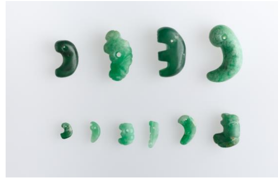
2-2：翡翠勾玉 佐賀県宇木汲田遺跡 佐賀県立博物館蔵