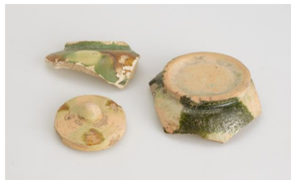
4-2：奈良三彩小壺 羽咋市寺家遺跡 石川県埋蔵文化財センター蔵