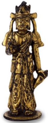
5-1 : 金銅菩薩立像 渤海上京城 東京大学総合研究博物館蔵

During the Nara and Heian periods, envoys were sent to Japan from Balhae, which was located on the opposite shore of the Sea of Japan. The envoys often travelled via the Hokuriku region, with accommodation facilities being established in Kaga and Noto. This exhibition features artifacts from the royal city of Balhae and documents related to the ports in Kaga and Noto.