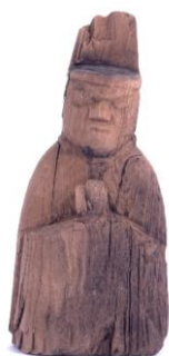
4-1：男神坐像 島根県青木遺跡 島根県立古代出雲歴史博物館蔵

In ancient times, the Sea of Japan was known as the 'Hokkai' and the Hokuriku region as 'Koshi'. This chapter explores the points of contact between Koshi and Izumo, based on religious archaeological findings and historical documents such as the Izumo no Kuni Fudoki and Kojiki.