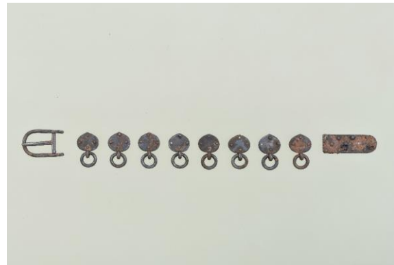
3-2：銀製帯金具 加賀市狐山古墳 東京国立博物館蔵