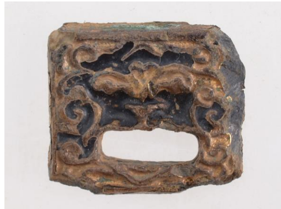
5-2 : 花文腰帶具 金沢市畝田ナベタ遺跡 石川県埋蔵文化財センター蔵

Exhibition period: April 29 (Sat) - June 11 (Sun), 2023 Hours: 9:00-17:00 (entry to exhibition rooms until 16:30) Holidays: Open daily during the exhibition period General admission: ¥1,000 (¥800) University and vocational school students: ¥800 (¥640) High school students and below: Free