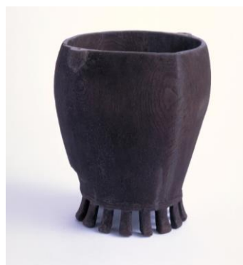
1-2 : 重要文化財 脚付桶 鳥取県青谷上寺地遺跡 鳥取県蔵