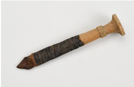
2-1：柄付き鉄製鉋(やりがんな) 小松市八日市地方遺跡 石川県埋蔵文化財センター蔵

From those discovered at the Yokaichi site in Komatsu City, it has been revealed that iron tools began to be used in the Hokuriku region in the mid-Yayoi period. In contrast to ironware, which was traded from the west, beads were actively produced in the Hokuriku region and distributed as far away as the San'in and Kyushu regions.